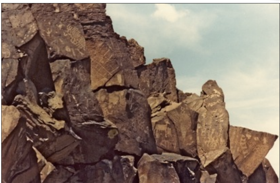
Note the closeup, below, of the rock on the left.